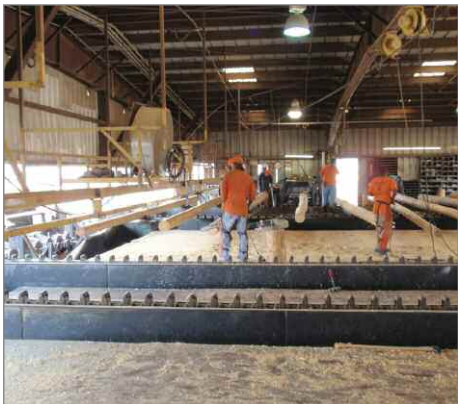
At the framing operation, branding and drilling occurs on 120,000 poles this plant treats each year.