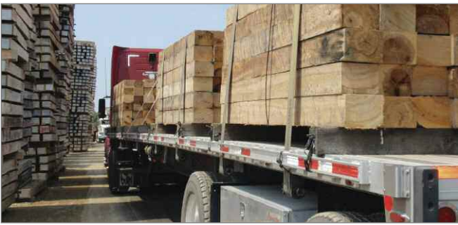
Inbound and outbound ties were visible everywhere one turned.