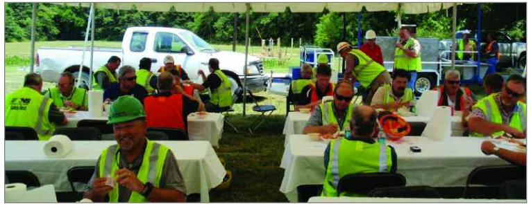
And the pièce de résistance was the best meal ever experienced by RTA Field Trip attendees.