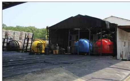
And the transformation continues as evidenced by these before-and-after pictures where the decades-old treating building is replaced by this modern, steel-framed enclosure. Four treating cylinders, ranging from 7.5'-8' in diameter and up to 140' long, should be capable of treating nearly 3 million ties annually on an air-dry basis. Current production in the next 12 months is expected to be around 2 million pressure-treated crossies.