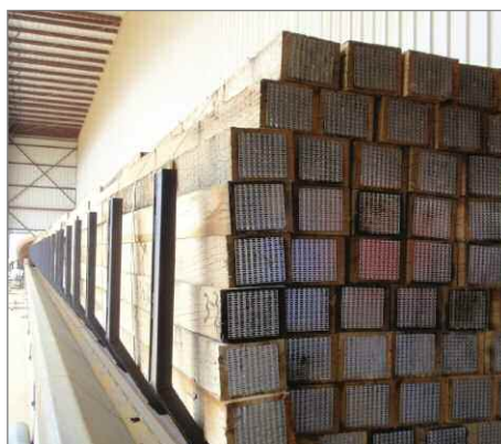
This system allows one man to take a loaded transfer table and charge...