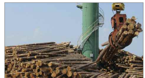
The last stop of the day was Chopin, La., where RTA members were treated to a tour of the Roy O. Martin SYP plywood plant there. For safety and other reasons, no pictures were allowed in the plant, but this is a view of the log yard. Employing 700+, the plant manufactures SYP plywood in a variety of grades and thicknesses, while maintaining an annual production volume of nearly 500 MMSF (3/8" basis).