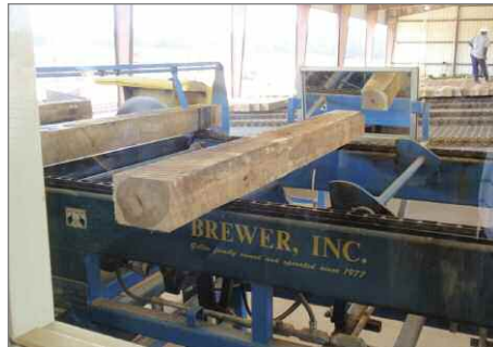
After a safety briefing, the tour started in possibly the most spacious and comfortable tie grading booth in the industry which, for many reasons—not the least of which is safety—offers the grader a panoramic view of the entire grading, incising and end-planting operation.