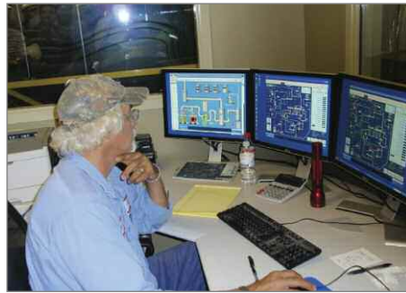
The treating plant, built to have a 1.8 million tie annual capacity on an air-dry basis, is also fully automated and truly state of the art.