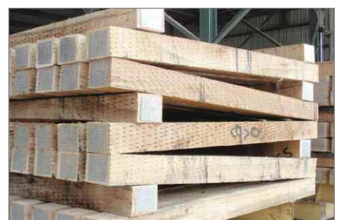
Their investment in new incising equipment from P&G turns out some beautiful deeply and uniformly incised ties. Gross and Janes is projected to procure and handle nearly 3 million ties in the next 12 months due to ramped-up demand from their railroad customers.