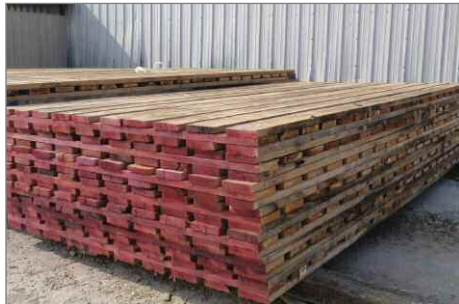
...how they produce 100+ 8'x14'-16' pipeline and oilfield multi-ply mats per day. They do custom mats, too.