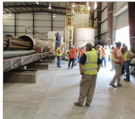
Colfax has four cylinders that process all four pole treatments: Penta, Creosote, CCA, and CCA ET.