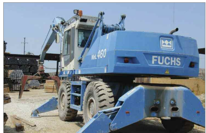
Two unique pieces of equipment are pictured here. The Shuttlewagon (left), which can maneuver up to 15 fully loaded gondola cars around the facility, and this Fuchs piece (right), capable of loading a full bundle of treated ties into a railcar in one bite, were the talk of the stop.