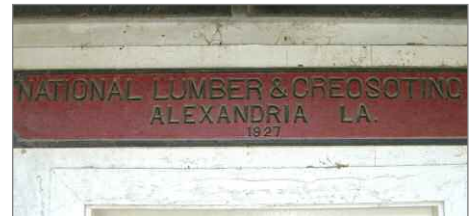
Originally incorporated as the National Lumber and Creosoting Company, the Alexandria, La., treating plant has been owned by Koppers, Roy O. Martin, Tangent Rail and others throughout its history.