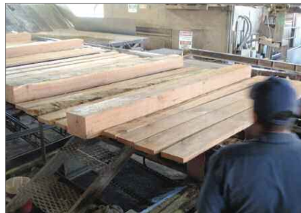
They also cut ties and 4/4 and 5/4 lumber for the flooring market along with crossies and rough 2x8 mat timber lumber.