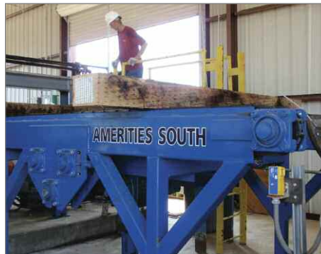
On the other end of the building, P&G Manufacturing's newest end-plater readies the ties for the air-drying yard.