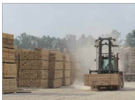
Serving BNSF, KCS (through Superior Tie), CP and Comapo of Mexico, this facility has been enlarged to increase capacity to 750,000 ties per year with space to air-dry nearly half a million ties for their customers.