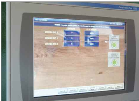
This plant, serving Union Pacific Railroad, employs the newest technology throughout, and it starts with TriDelta Systems Automation software in the grading area.