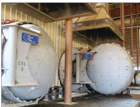
The Amerities treating plant was built from the ground up using TankFab 8'x156' cylinders and components and employing an automated transfer table system.