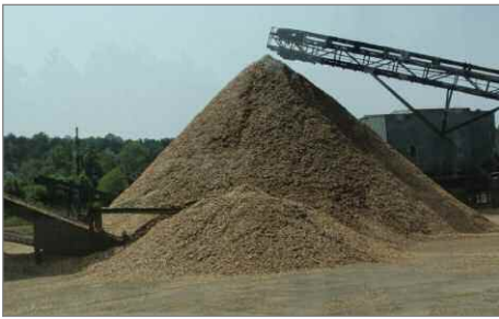
...which generates 5,500 tons of hardwood/softwood chips in a 55 percent/45 percent ratio on a weekly basis for local paper mills.