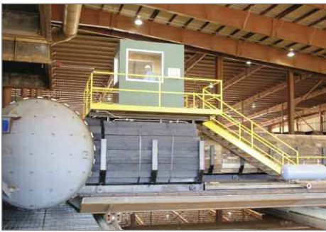
...and un-charge the treating cylinders without ever leaving the control booth or requiring a fork-lift to enter the area.